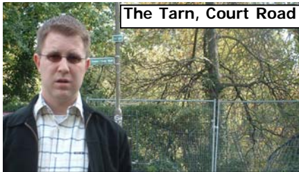
The Tarn, Court Road

"Of course the plans to allow the local petrol station to sell alcohol all hours of the day will only make matters worse."