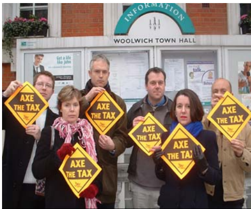
Local Lib Dem campaigners calling for the unfair council tax to be scrapped earlier this year.

Council Tax levels in Greenwich have increased 34% over the last five years and indications from the Labour Government show that they expect another big rise next year too.